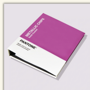
SKU#: GB1507C METALLIC CHIPS BOOK