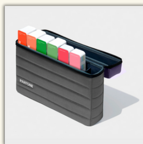
SKU#: GPG301B ESSENTIALS GUIDE SET