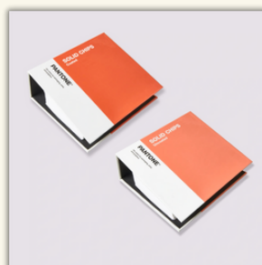
SKU#: GP1606B PANTONE SOLID CHIPS | COATED & UNCOATED