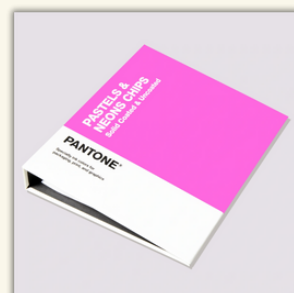
SKU#: GB1504B PASTELS & NEONS CHIPS | COATED & UNCOATED