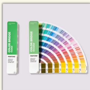
SKU#: GP6102B PANTONE COLOR BRIDGE GUIDE SET | COATED & UNCOATED