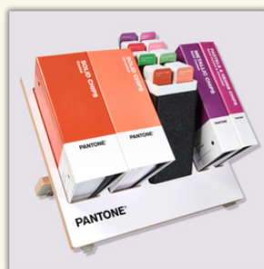
SKU#: GPC305B REFERENCE LIBRARY