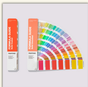
SKU#: GP1601B PANTONE FORMULA GUIDE | COATED & UNCOATED